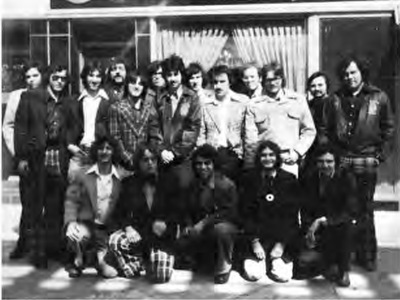
The brothers of Theta Beta, N.Y.U. and Beta Eta, Brooklyn College stand outside the restaurant following an Induction Dinner held in honor of the new brothers of both chapters.

Since its recent reactivation, Theta Beta Chapter, New York University has established an activity pace that is difficult to keep up with. The brothers have had many accomplishments on a chapter level, in the Third District, and on campus.