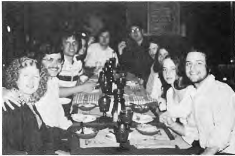
The North Jersey Alumni Club and their guests enjoy a dinner at the Manasquan Inn.